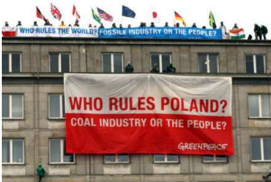
Photo 5: At the World Coal Summit: Greenpeace banner