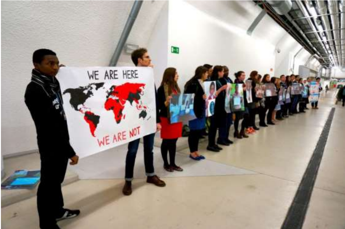
Photo 6: World map reading “WE ARE HERE/WE ARE NOT”

HERE/WE ARE NOT,” indicating that youth from the Global South were absent from the COP19.