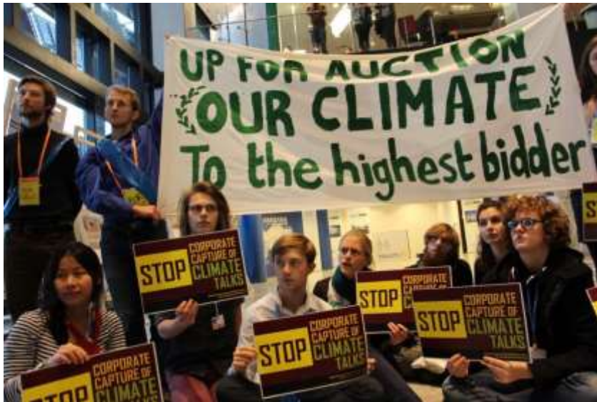
Photo 3: The climate auction for corporations