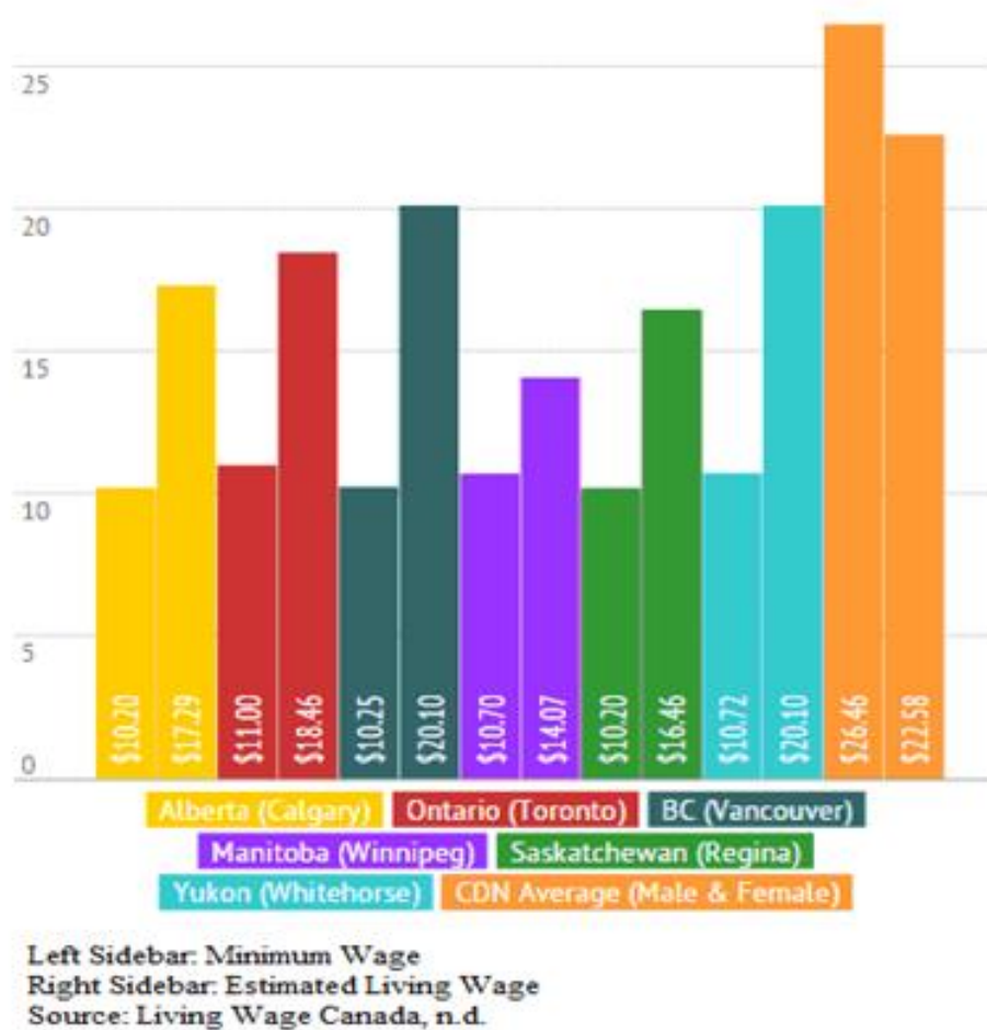
Figure 2: Minimum Wage vs. Living Wage (Select CDN Cities) Hourly Pay, 2015

However efforts to improve the minimum wage have had some success. In Ontario, where the minimum wage was frozen for 12 of the last 20 years, activists have made important strides. Between 2004 and 2010, the minimum wage was raised from $6.85 to $10.25. It was subsequently frozen for the next three years, however, eroding real purchasing power. In 2012 a coalition of more than a dozen advocacy groups and trade unionists came together to form the Campaign to Raise the Minimum Wage to $14. Under mounting pressure from social justice, labour and community-based organizations, in June 2014 the general minimum wage increased to $11 and in November 2014, following in the footsteps of Yukon, was indexed to inflation. The minimum wage rose to $11.25 in October 2015. Under pressure from poverty reduction and social justice advocacy coalitions, the government of Ontario also established a Minimum Wage Advisory Panel in June 2013 which undertook a formal review of the province’s approach to minimum wage setting. The Panel reported its four recommendations in December 2013 which were as follows: 1) the minimum wage be revised based on the change in the consumer price index