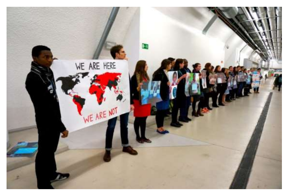
Photo 6: World map reading "WE ARE HERE/WE ARE NOT"

HERE/WE ARE NOT," indicating that youth from the Global South were absent from the COP19.