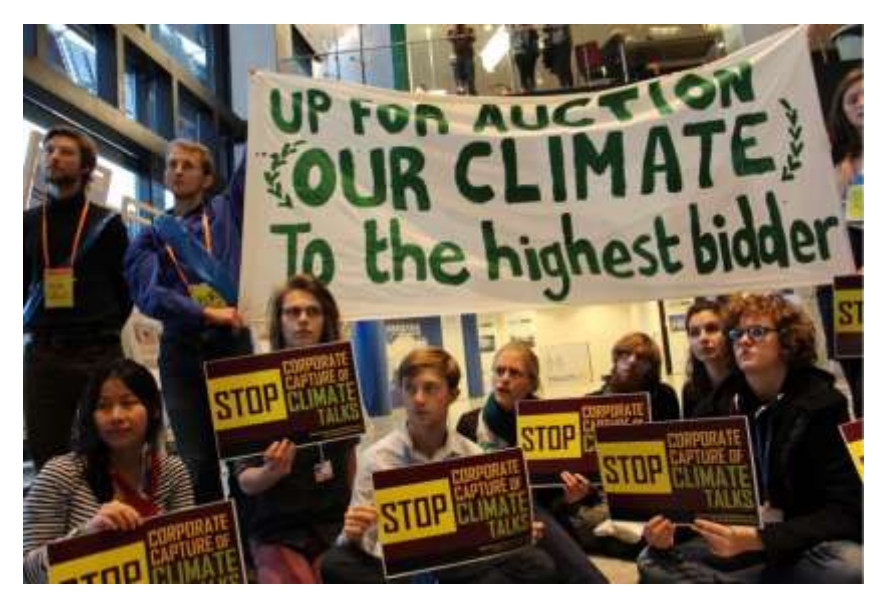
Photo 3: The climate auction for corporations