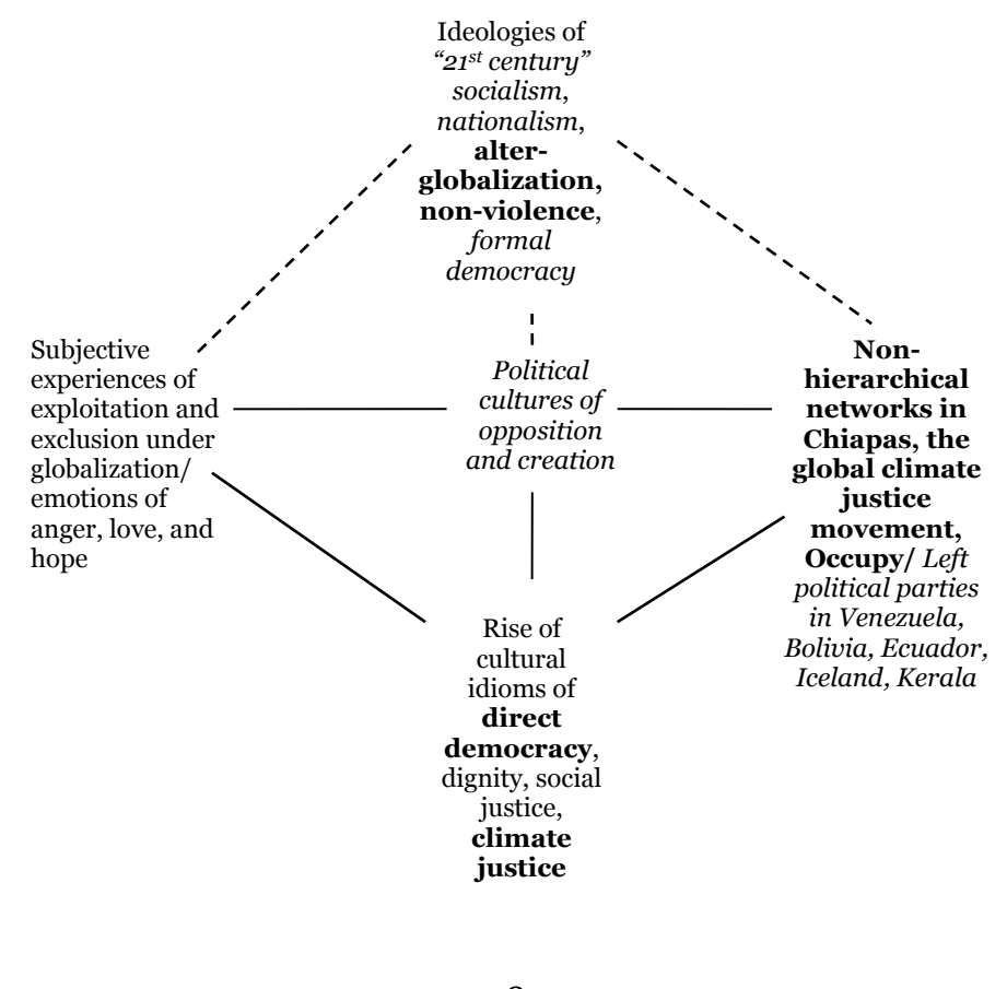
Figure 2 The emergence of "new" political cultures of opposition and creation in the twenty-first century (dotted lines indicate relationships that are more loosely connected): the cases that are bolded have pursued the path of not taking power, while those in italics have taken, or sought to take, national power. Commonalities across both types are left in plain text without italics or bolding.

and the Latin American "Pink Tide," pushed from below by efforts to build more participatory societies on the part of diverse sectors of their population, most radically, in Venezuela, Ecuador, and Bolivia. The other is the path of consciously not taking national power, but seeking to transform its nature in less hierarchical bodies which govern themselves far more directly, carving out autonomous spaces both below the nation at the level of the community as the Zapatistas and Occupy are (or were) doing, or above it, as the many strands of the global justice movement and now global climate justice activists have sought to do. We might think of these as the "taking power" strategy versus the "remaking power" approach. These new options are depicted in Figure 2.