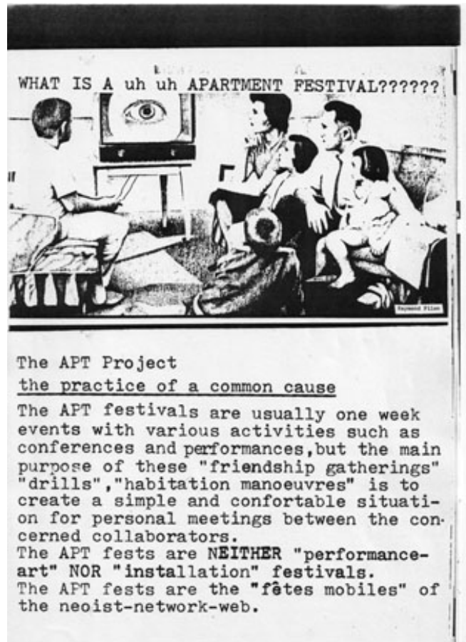
"What is an uh, uh, Apartment Festival", image from the Centre de Recherche Neoiste, publication, 1981.

collective movements such as the Luther Blisset Project (LBP) and in the actions of different net.artists, including the Italian 0100101110101101.org (www.0100101110101101.org) and the Wu Ming collective of writers (www.wumingfoundation.com). Pranks and actions of culture jamming focus on continual poetic renewal (Vale and Juno, 1987), creating artistic, cultural and political new experiences, using the unexpected, and a deep level of irony and social criticism.