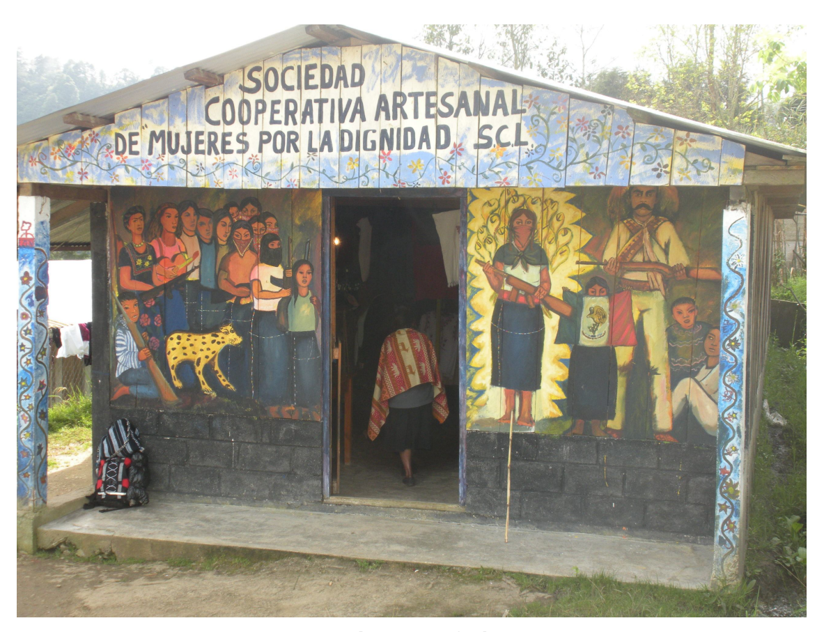
Juntas de Buon Gobierno

la política occidental. Contra el paradigma occidental de democracia representativa que hoy contribuye al colapso de nuestro mundo, los zapatistas han impulsado su propio modelo definido por el filósofo mexicano Luis Villoro<sup>8</sup> como "democracia comunitaria". Este es un hecho que rompe con múltiples vicios de las prácticas de la democracia universal impuesta desde occidente, la democracia comunitaria de las juntas de buen gobierno tienen características que retoman prácticas de asamblea propias de la organización pre occidental y se impulsan, mediante estas: un gobierno que permite la revocabilidad del mandato, participación de todos los miembros de la comunidad en una elección, rotación del mandato, equidad de genero en la representación, gobernantes sin sueldos, etc. Este hecho, que pareciera ser un pequeño logro, trae grandes cambios en la pretensión de un proceso de transformador, los zapatistas buscan romper con las prácticas de corrupción que podrían darse desde las autoridades y rompen con el entendimiento de la política del "especialista".